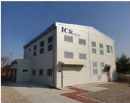
Ex Test Building