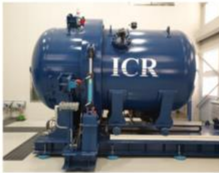
Ex "d" Test Chamber