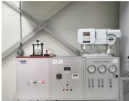
Spark Ignition Tester