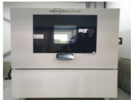
Thermal Endurance Chamber